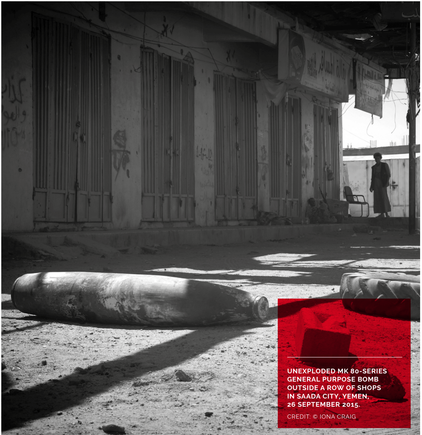
UNEXPLODED MK 80-SERIES GENERAL PURPOSE BOMB OUTSIDE A ROW OF SHOPS IN SAADA CITY, YEMEN, 26 SEPTEMBER 2015.

ANY RIGOROUS RISK ASSESSMENT WILL REVEAL AN OVERRIDING RISK THAT THE EXPORT OF LETHAL MILITARY EQUIPMENT TO SAUDI ARABIA IN CURRENT CIRCUMSTANCES IS LIKELY TO BE USED IN FURTHER VIOLATION OF IHL AND IHRL IN YEMEN. SUCH EXPORTS SHOULD THEREFORE BE REFUSED BY ALL ATT STATES PARTIES.